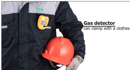
Gas detector can clamp with a clothes

Gas type : Formaldehyde (CH 2 O) Measuring type : Diffusion Sensor type : Electrochemical (EC) Measuring range : 0...20 ppm Accuracy : ±5% of full scale Resolution : 0.1 ppm Sensor life : 1...3 years Display indicator : LCD screen Body material : PC+TPU Alarm method : Sound, LED, light, vibration Sound intensity : >90 dB Operating temperature : -20...+60°C Operating humidity : 10...95%RH (non-condensing) Operating pressure : 80...120 kPa Power supply : Lithium battery 3.7V/ 1200 mAh (rechargeable) Continuous work hours : 20 days (in room temperature) Charge time : approx. 2.5 hours Protecting : IP67 Dimension : 92 x 58 x 49 mm (HxWxD) Weight : approx. 132 g Certificates : CPA ; 2023CA0118-32, EX ; Ex ia II CT4 Ga