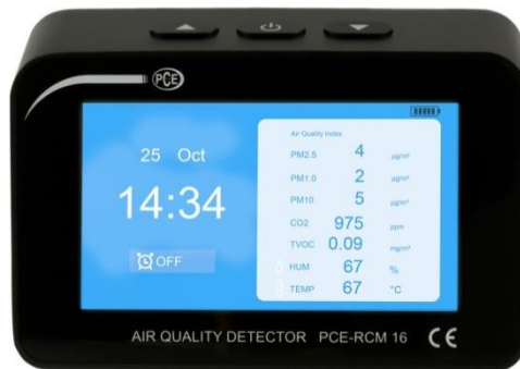
Figure 2 List view