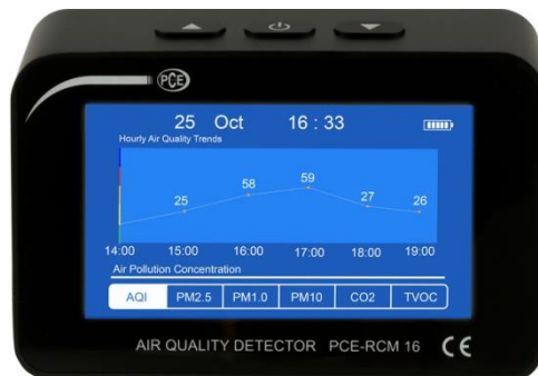
Figure 3 Graphic view