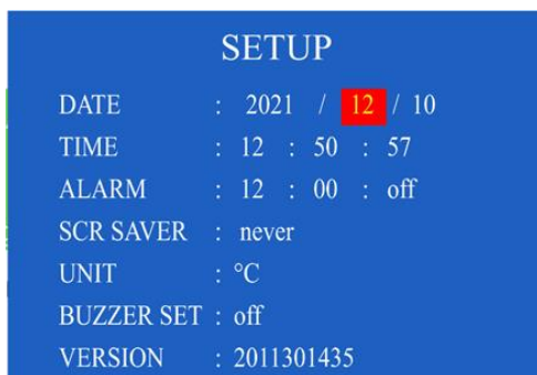
Figure 4Setup menu

Note: The unit can also be operated permanently with a mains adaptor.