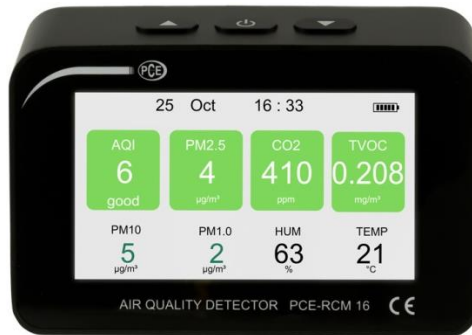
Figure 1 Standard view