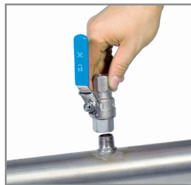
A Screw neck

By means of the drilling jig, it is possible to drill under pressure through the 1/2" ball valve into the existing pipe. The drilling chips are collected in a filter. Then install the probe as described under 1).