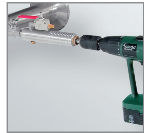
Drill under pressure with the CS drilling jig

3) Due to the large measuring range of the probe even extreme requirements to the consumption measurement (high volume flow in small pipe diameters) can be met.