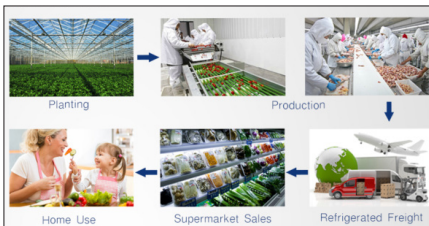
Food cold chain

Waterproof plastic bag It will protect the data logger from water and make the device become IP67