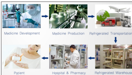
Pharmaceutical cold chain