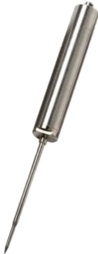
vary length size of probe!