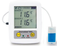
TD1F - PHM data logger with 1 probe