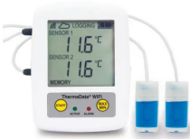
TD2F - PHM data logger with 2 probe