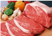
Frozen food industry