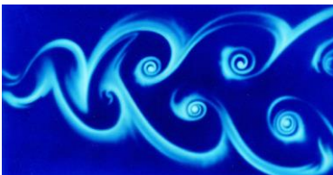
Kármán vortex street