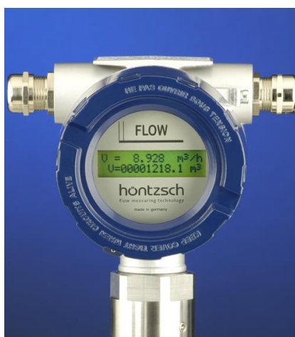
Ex-d transducer housing with optional LCD display