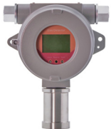
GIP - (gas type) - (range) - N Gas detector without alarm