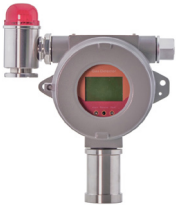
GIP - (gas type) - (range) - A Gas detector with alarm