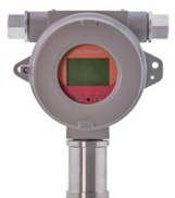
GIP - (gas type) - (range) - N Gas detector without alarm