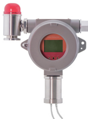
GIP - P -(gas type) - (range) - A Gas detector with alarm